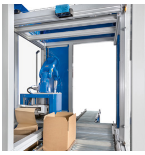
1. VOID DETECTION TO DETERMINE THE AMOUNT OF PROTECTIVE PACK-AGING MATERIAL REQUIRED

An AUTO.PROTECT solution can feature air or paper cushions depending on your requirements. Here you can see the functions of an application with paper cushions: