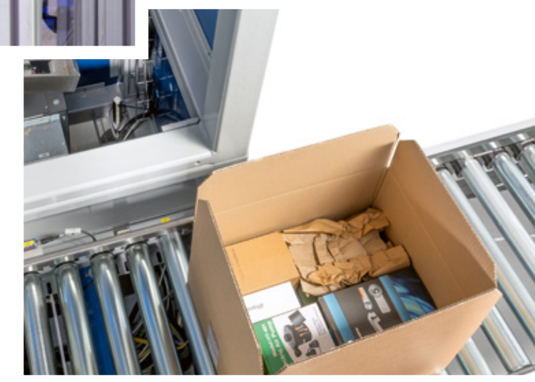
4. WITH THE PRODUCT RELIABLY PROTECTED, THE BOX CAN UNDERGO FURTHER PROCESSING