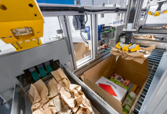
AUTO.PROTECT application with PAPERplus® paper pads.