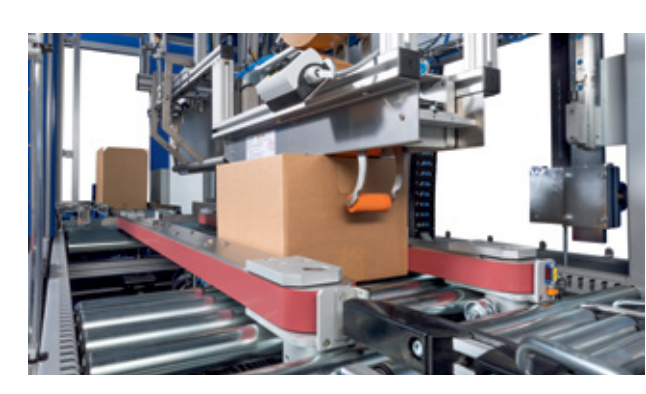
3. SEALING WITH SELF-ADHESIVE TAPE, WATER-ACTIVATED TAPE, OR HOT-MELT ADHESIVE