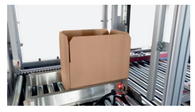
1. AUTOMATIC DETECTION OF BOX FORMAT