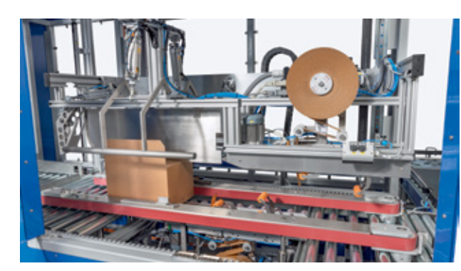
2. FOLDING OF LID FLAPS