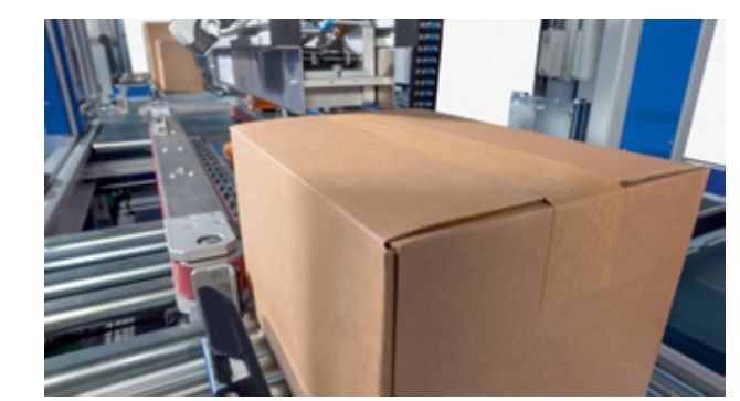
4. THE SEALED BOX IS READY FOR FURTHER PRO-CESSING