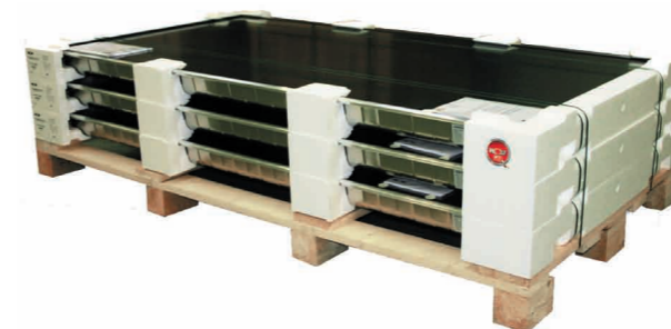
Protective blocks and rails in EPS for solar panels