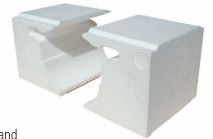
EPS protective blocks for solar modules

Storopack develops, produces and markets custom-tailored moulded components and protective packaging made of expandable foams such as EPS (expanded polystyrene) and EPP (expanded polypropylene).