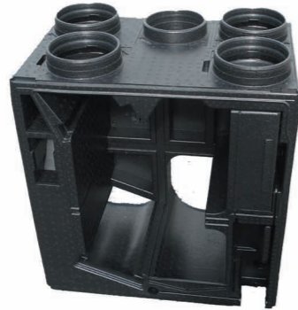
EPP housing for domestic ventilaton system

Alongside their protective properties, these applications benefit primarily from the insulating properties of our materials.