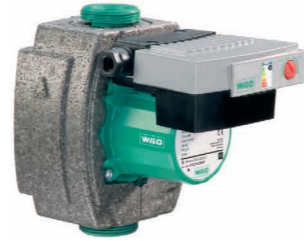
Pump insulation made of P-EPP