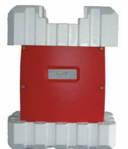
Bespoke EPS protective padding

Safe packaging of heavyweight devices containing sensitive electronic components: Padding is used to protect inverters from damage and vibrations during transport. EPS is particularly pressure and impact resistant, has good high energy absorbing properties and is extremely lightweight at the same time.