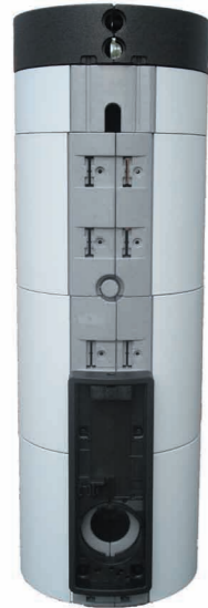
Boiler insulation made of a Neopor / EPP combination

Our products are used in the heating, plumbing and air conditioning sector as insulators for pumps, heating controllers or boilers, or as housings for modern ventilation systems in the home.