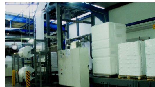
Fully automated packaging machine