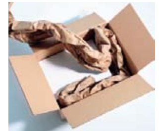
Block and brace objects to prevent migration.