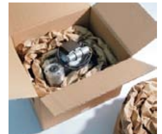
Coil or wrap to stabilize and protect heavy objects.