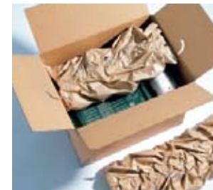
Convenient and light-weight for void-fill applications.