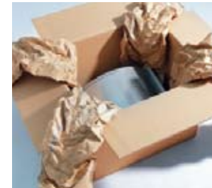
Protect fragile items with cushioning.

PAPERplus® GE produces a superior paper mattress that fills a wide range of needs!